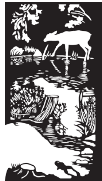
Jennifer Stead, Narrative of Nature (1 of 36) , digital image, 2010

Alisdair MacRae and Negar Neyfollahy poetically reconnect urban travellers with nature's guidance systems. Imprint: Intersections of City & Sky will be installed in Stittsville as a series of 20 designs drawing attention to visible constellations in the north-eastern and south-western sky along Hazeldean Road.