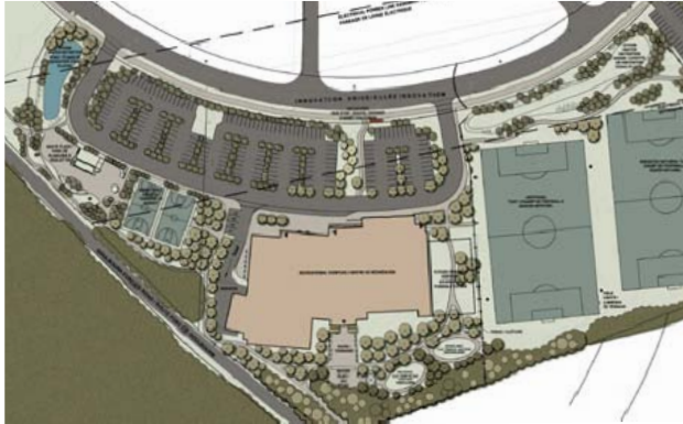
Aerial view of Kanata North Recreation Complex Site Plan.

Six regional artists have been shortlisted by the committee for the KNRC commissions: