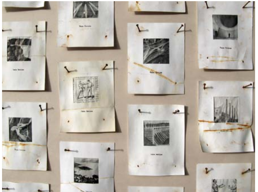
Paul Roorda, Take Notice (detail), 2010, mixed media

Vintage encyclopedia pictures and Polaroid sky photos are nailed to utility posts, becoming weather damaged over time. Discovered on location or viewed as a collection in the gallery, they reflect the escalating anxiety about climate change that has replaced the fading optimism of unsustainable progress.