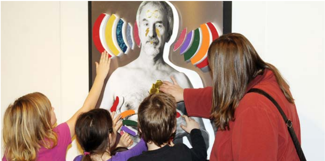
School students from École St-Mathieu in Hammond, Ontario tour the exhibition on Access Ability Day 2010. Perceptions was launched on AccessAbility Day (December 3rd) in recognition of the International Day of Persons with Disabilities.

The success of the Perceptions exhibition has reinforced the Public Art Program's commitment to expanding access to the City of Ottawa's Fine Art Collection. Implementing touch screen technologies, increasing the presence of sign language, providing large-print signage, and offering web access to the City's art collection are new projects for the Public Art Program in 2011.